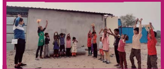
Mental Health recreational activity