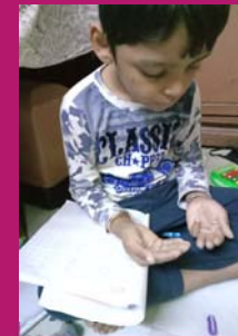
Studies during covid

We continue to provide self-paced e-learning computer platform to the children living in slums by engagement through NIIT. The process of upgrading the system is underway to provide more effective e-learning and network browsing.